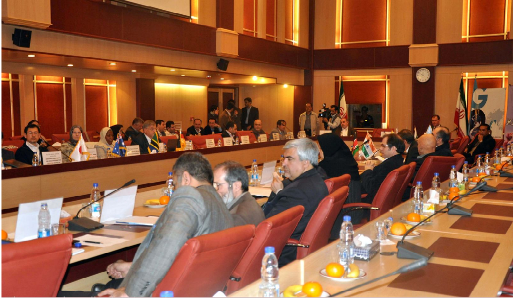
IOGOOS -8 Inaugural Function