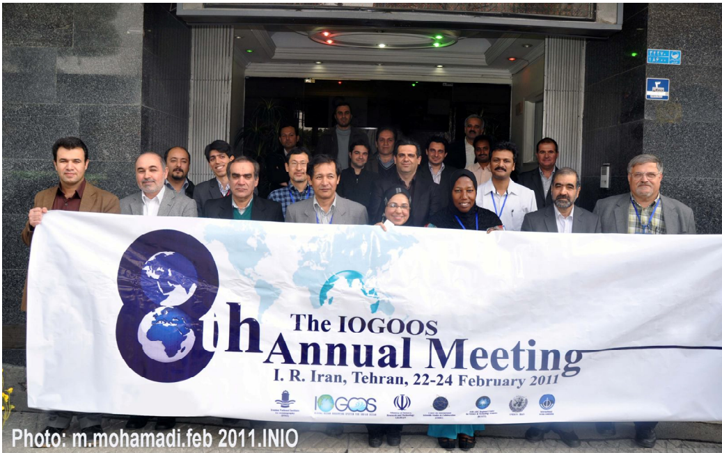
IOGOOS Annual Meeting Group Photo